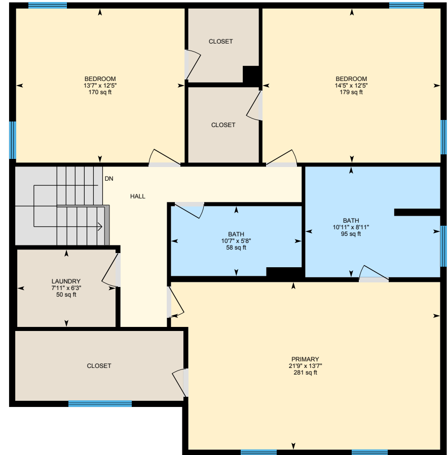
2nd Floor Finished Area 1237.74 sq ft